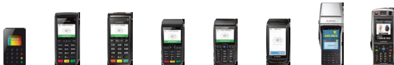
EP360 CT280 CT281 MT280 MT281 MT401 BIP1300 BIP1500